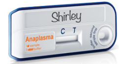
VetScan® Canine Anaplasma Rapid Test